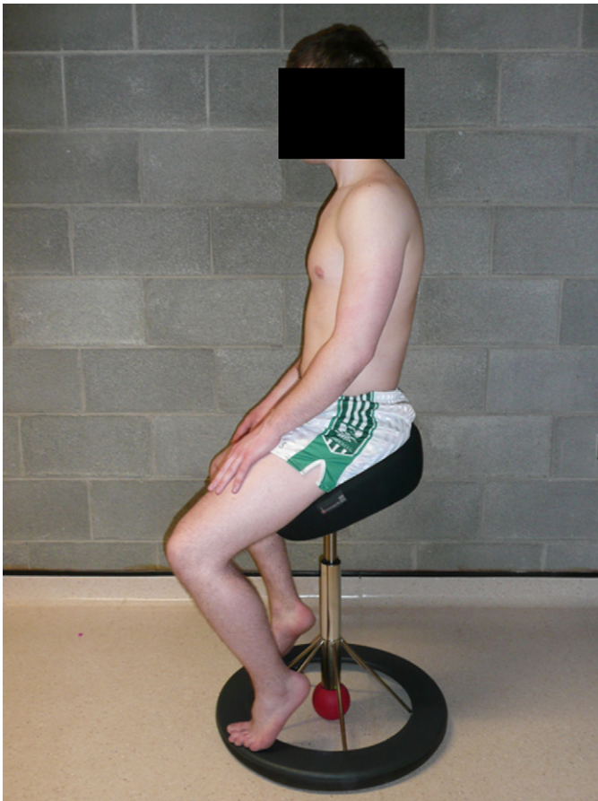
Fig. 1. Neutral sitting on the Back App.