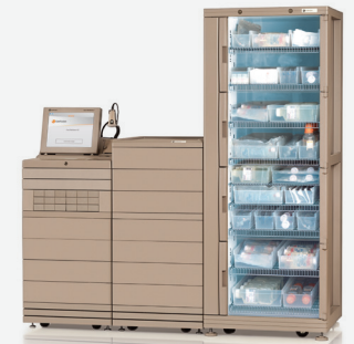
Pyxis MedStation ES system typical configuration

To learn more about the new Pyxis ES platform, Pyxis MedStation ES system and additional Pyxis technologies, ask your CareFusion sales representative or contact us at communications@carefusion.com