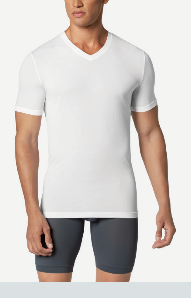
Light Air High V-Neck Undershirt $62 Stays tucked. Stays dry. Stays hidden Available now