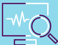
PATIENT MONITORING DEVICES