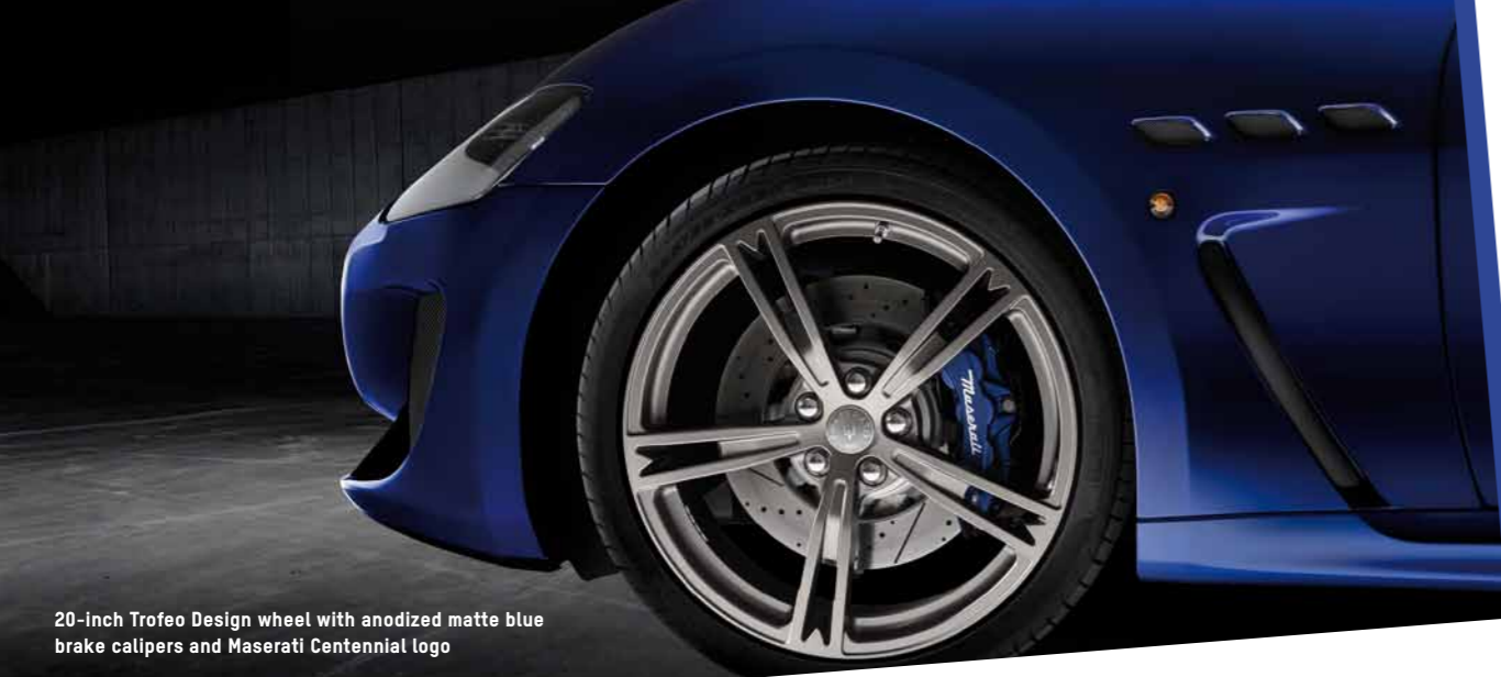
20-inch Trofeo Design wheel with anodized matte blue brake calipers and Maserati Centennial logo

With racing looks designed to excite and inspire, the GranTurismo Convertible MC Centennial Edition makes a unique and stunning visual statement through its special Blu Inchiostro color. This special three-coat paint finish with deep, dark glints, has been specifically developed to combine with the lighter shades of the cabin, creating a dramatic transition between exterior and interior. It pays homage to Maserati's racing blue, expressing the passion and intensity of the marque.