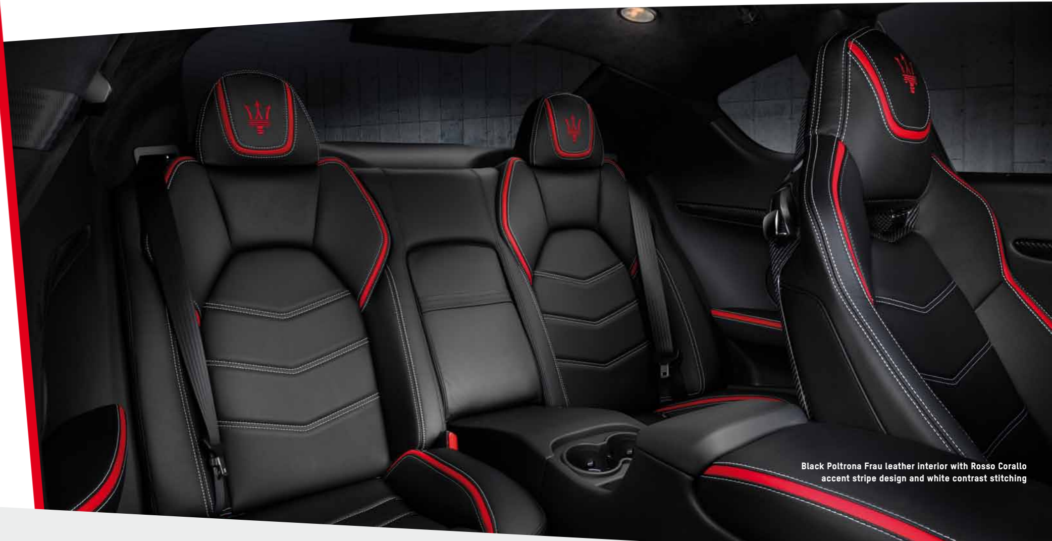
Black Poltrona Frau leather interior with Rosso Corallo accent stripe design and white contrast stitching

INTERIOR | THE MASERATI GRANTURISMO MC CENTENNIAL EDITION