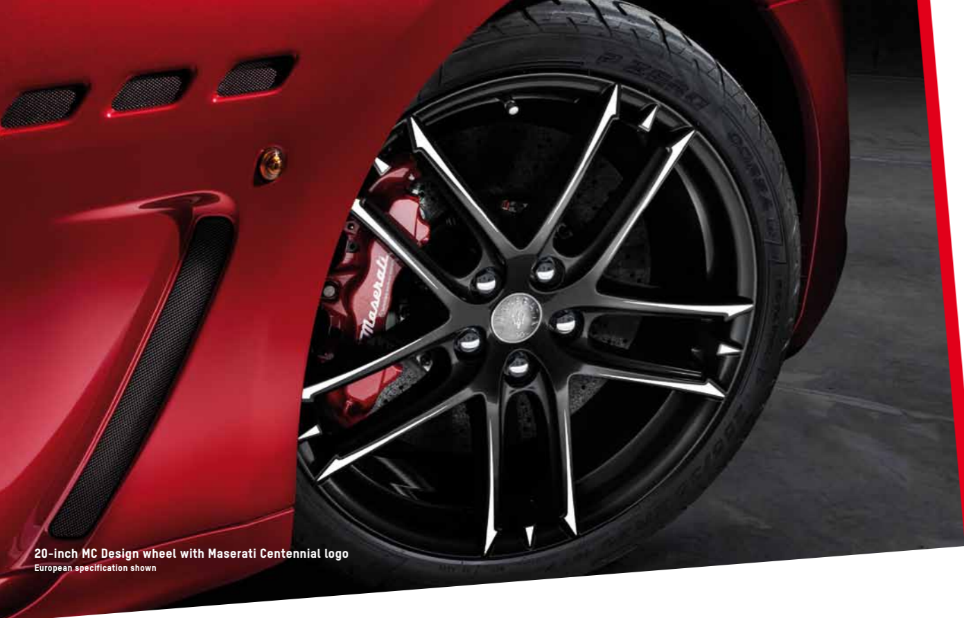
20-inch MC Design wheel with Maserati Centennial logo European specification shown